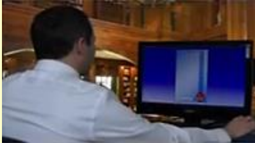
Chicago adjuster sending number to First Court